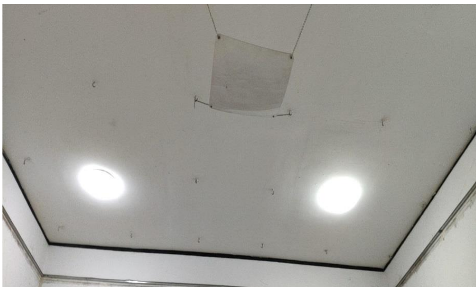
6" concrete slab with no drop ceiling