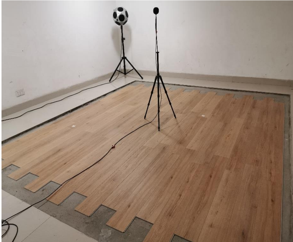
Test set up